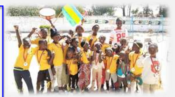
Gabon was the country that came out on top and they knew how to celebrate!