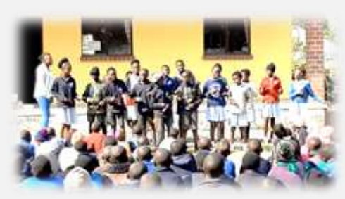
Performing in assembly... 'Re, re, re, recycle rap'