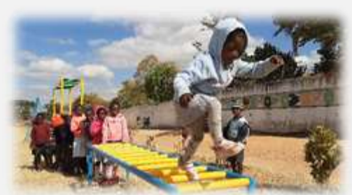
Gift not missing a step and jumping off the ladder frame