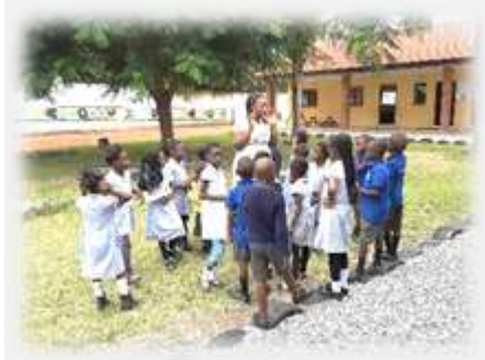
Having an adventure outside to see what animals we can find